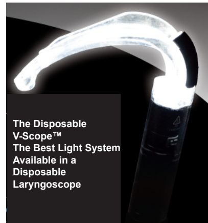
The Disposable V-Scope™ The Best Light System Available in a Disposable Laryngoscope

The Prone XL™ The Supine XL™ The Cardiac Leg Support XL™